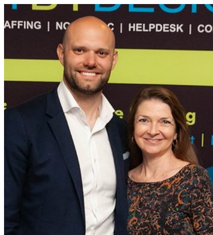
James Clear, author of Atomic Habits and Global Leadership Summit 2023 Speaker.

If you have Server Operating System 2012 R2 or Aging Equipment, you won't want to miss this!